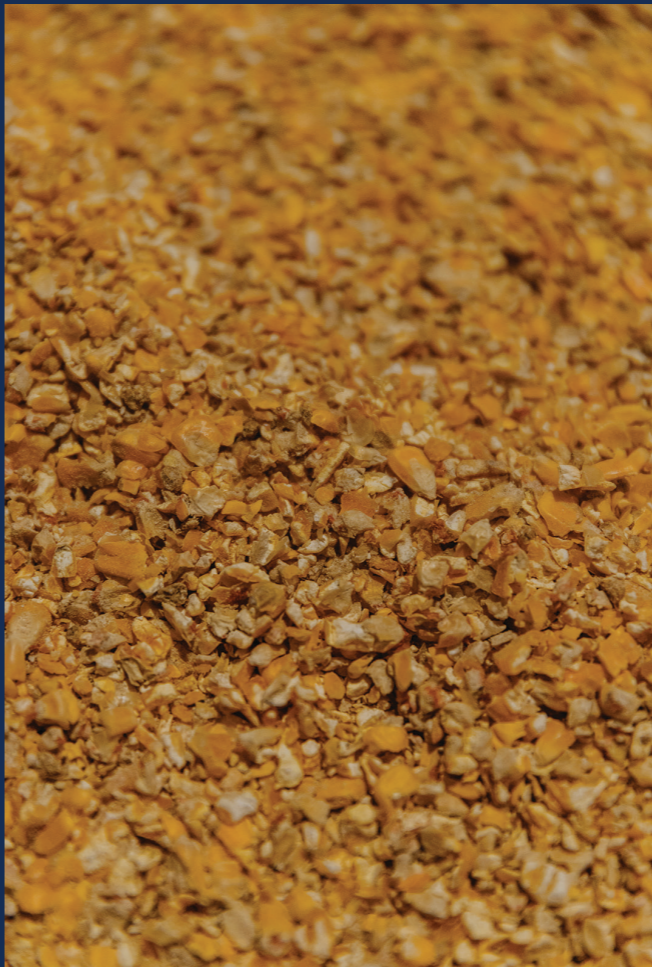
WHEAT, BARLEY, MAIZE

FGO is a premium grain pellet, consisting of oats & wheat, offering high energy and starch levels, combined with good levels of protein, supplied in a concentrated, pelleted form. FGO is suitable for a large range of applications throughout the year, either in blends or fed on its own.